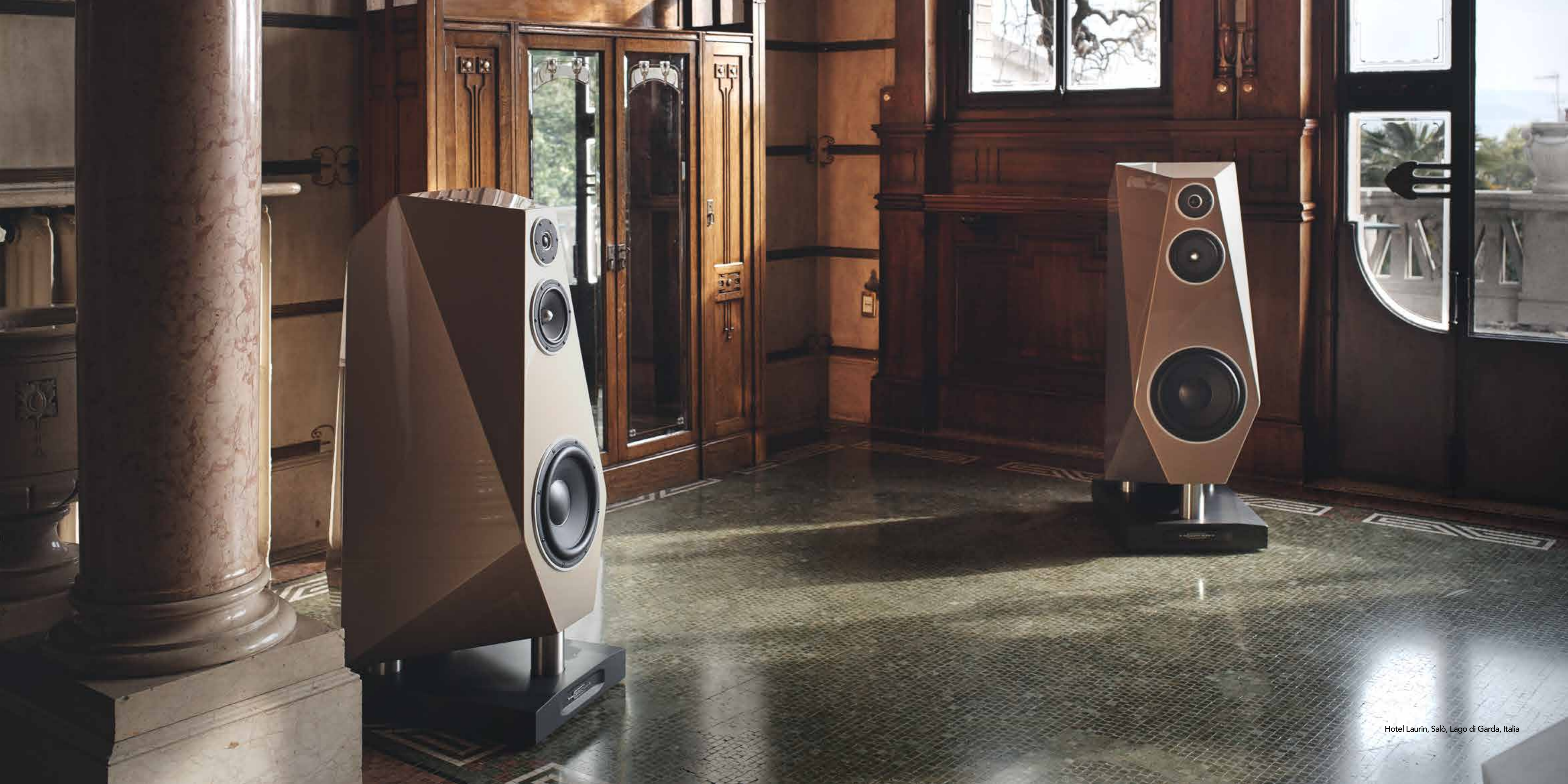
Hotel Laurin, Salò, Lago di Garda, Italia